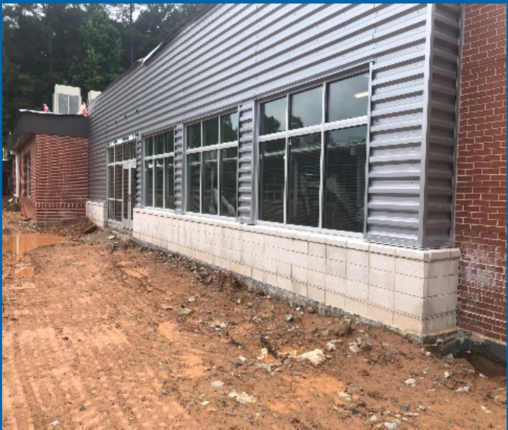
Chamfered Block Installation