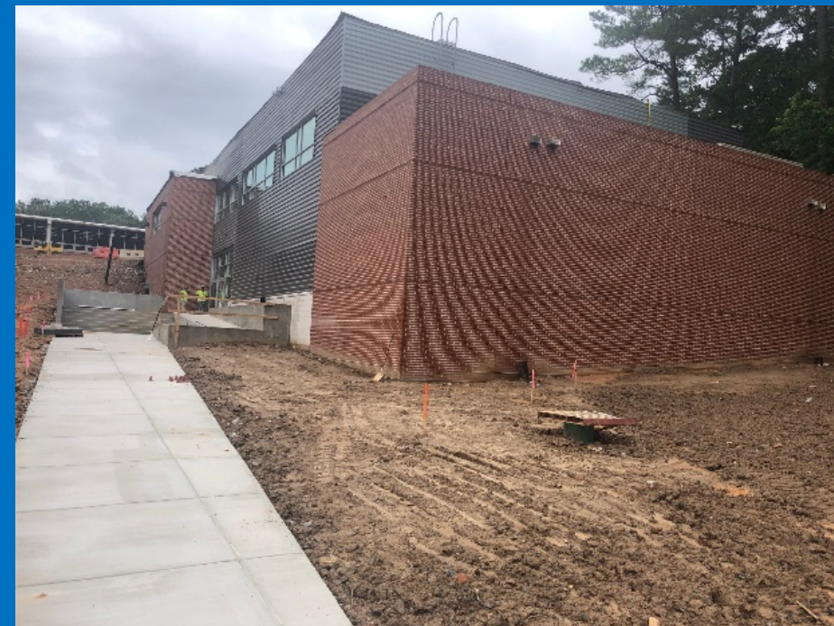
Gymnasium Ramp and Stair Completion