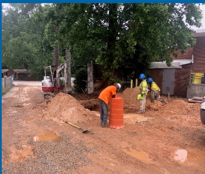
Installation of Underground Utilities