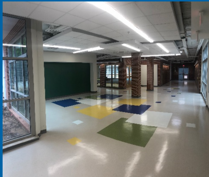
Main Entrance Floor Wax Complete