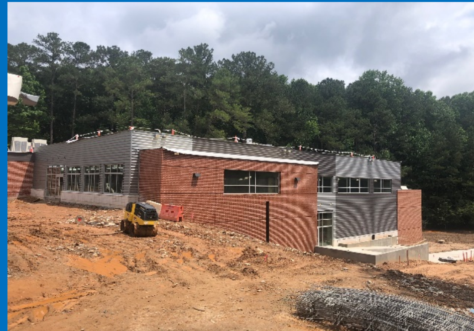
Gymnasium South East Elevation Progress