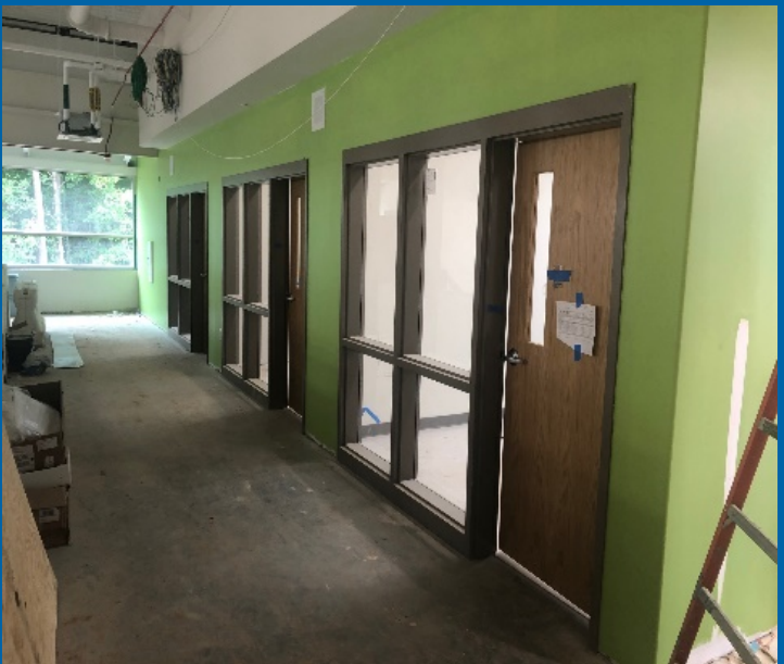
Gymnasium Door & Hardware Installation