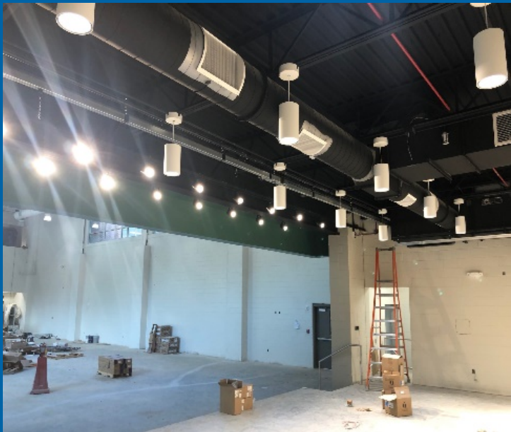
Gymnasium Stage Lighting Installed